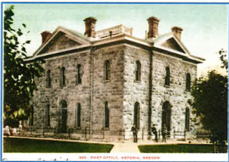
The original building: image from an old picture postcard

The original building was demolished in 1931 to make way for the present post office, built in 1933.