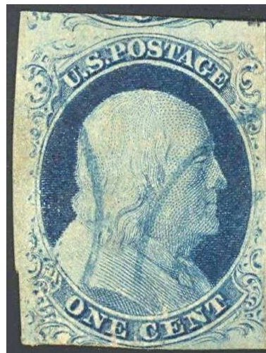
US Scott #9 from the Author's Collection

plates, only five were used for the imperf stamps (1E, 1L, 2, 3, & 4), the rest for the perforated stamps of 1857. This means of all the positions of the 1¢ imperf, 999 had some portion of the design cut away and 1 was complete. The current census of Scott #5s as published by Siegel in 2001 shows 56 used singles, 6 used in pair with a different number, 3 used in a strip of three, 10 on cover as singles, 3 on cover in pairs and 9 on cover in strips of three (there are also 6 examples known where the stamp has been removed, destroying the cover). There are also 3 unused Scott #5s, one without gum, one as part of a large block with original gum (eight stamps in the block, one row of six, one row of two) and one that has been cleaned to remove toning. That gives us 90 total #5s known, though now there is a 91st.