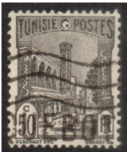
Tunisia Sc #87 w/ (Pa)quebot Cancel

Within the genre of nautical philatelics are paquebot markings. By postal convention, sailors are allowed to post mail while abroad using stamps from their home country. The mail receives a special cancellation indicating it was mailed under this agreement. This opens the possibility of finding postal markings on stamps from other than the country of issue in the piles of common stamps that a dealer may not have examined closely. For some obscure reason, undoubtedly related to that unfortunate childhood incident during potty training, I find this quite fascinating. Each time the dumpster diver discovers another overlooked ship type cancellation, he becomes as happy as a sailor with a full cup of grog.