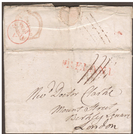
1808 folded letter from Dublin

The exact date of the establishment of the Post Office in Ireland is unknown. The Earliest recorded reference to a Postmaster dates from 1638. The Irish Postal System was under the control of the Postmaster General of London. The Irish Constitution of 1782 established the Irish Postal System as an independent organization. At least until a Commission of Inquiry Investigation of 1828 found that the costs of the system were substantially out of line with the revenue produced from the services provided. The Irish Post Office came back under the control of the London Postmaster General in 1831.