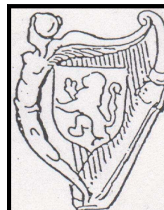
Drawing of the Harp framed Oliver Cromwell Coat-of-Arms

of Harp one of two types of Irish Harps - the other being the Brian Boru type (15th Century).