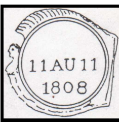
Drawing of a Dublin Harp Postmark

This folded letter dates from the time of an Independent Irish Postal System. It was posted in Dublin on July 29 1808 to a Doctor in London. It is cancelled with the distinctive “Harp” or “Mermaid” postmark of that date. It also has a Bishop’s mark of August 2 1808 - probably as a receiving cancel in London.