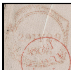
London Bishops mark over the Dublin Harp Cancel

This folded letter dates from the time of an Independent Irish Postal System. It was posted in Dublin on July 29 1808 to a Doctor in London. It is cancelled with the distinctive “Harp” or “Mermaid” postmark of that date. It also has a Bishop’s mark of August 2 1808 - probably as a receiving cancel in London.