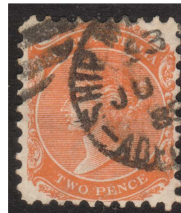
South Australia Sc. #65 with Ship Mail Cancel

my quest (I grovel for philatelic scraps, and will dance a complete jig for ½ a 50 cent Columbian Expo stamp). I have found nice paquebot cancels on common definitives from Great Britain, Australia, New Zealand and Hong Kong. A few are shown here; nice paquebot cancels on stamps from Indochina, Tunisia and Australia as well as a ship cancel on the South Australia stamp. Most of these cost a nickel or a dime.