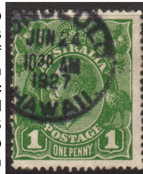
Australia Sc. #67 with Honolulu HI Cancel

The dumpster diver has found at kilo nights, in circuit books or amongst the piles of rather common stamps a multitude of paquebot markings on stamps. Through experience and research in the philatelic library, I have uncovered a number of good places to look. In addition, various OSS members have apparently decided to amuse themselves at times by assisting in