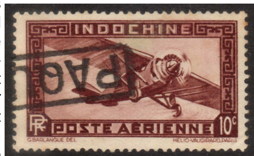
Indo-China Sc. #C4 with Paqu(ebot) boxed cancel.

The dumpster diver has found at kilo nights, in circuit books or amongst the piles of rather common stamps a multitude of paquebot markings on stamps. Through experience and research in the philatelic library, I have uncovered a number of good places to look. In addition, various OSS members have apparently decided to amuse themselves at times by assisting in