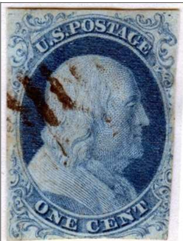
US Scott #5 sold on eBay for $32,300

Scott #5 is a stamp that is a true rarity in USA collecting. When the 1851 issues were first created the engravers made the clichés just a little bit too big, they'd only fit if they were placed with no spacing between the individual