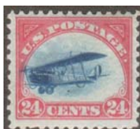
US #C3 "Fast Plane" Variety.