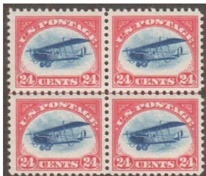
US #C3 Block of 4 with horizontal centerline - very nice centering.

Auction catalogs should be mailed about March 1st. Auction lot previewing will begin at the Rose City Stamp Fair on March 8th, with additional viewing opportunities on the 11th, 14th and morning of the 15th.