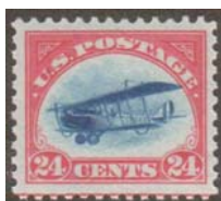
US #C3 With 2003 PSE Graded Cert.