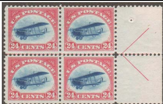
US #C3 Right margin block of 4 with arrow.

March 15th is quickly approaching. Our annual auction may not be as big as in the recent past, but it will have a few US #C3 stamps. The four lots shown here are a nice selection of the collectible varieties of this issue.